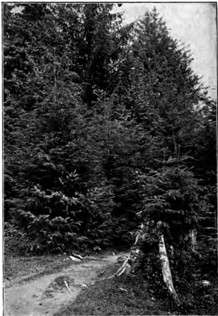
ALASKAN HEMLOCKS AND SPRUCES, SITKA